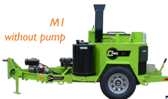
M1 without pump