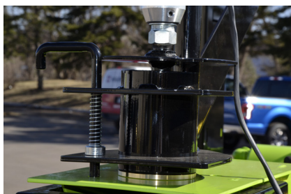
Stress-free boom rotates around hose.