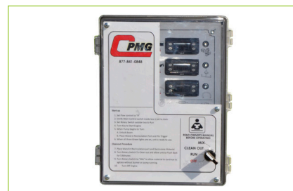
Simple seal controller.