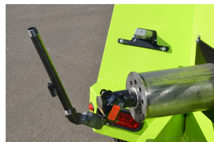
Optional heated draw-off option.