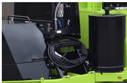
Optional rotary screw air compressor.