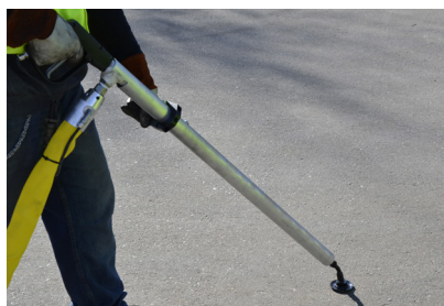
Electric heated wand option.