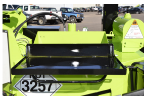
Lowest Height Largest Door