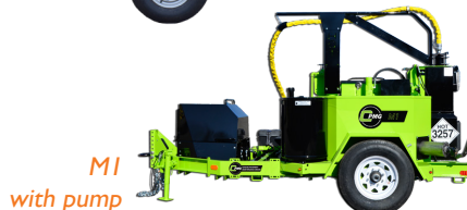
M1 with pump