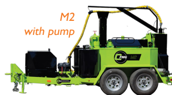
M2 with pump