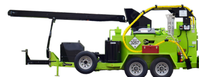
M4 dual hose, dual pump and conveyor