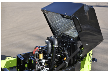
Optional engine cover.